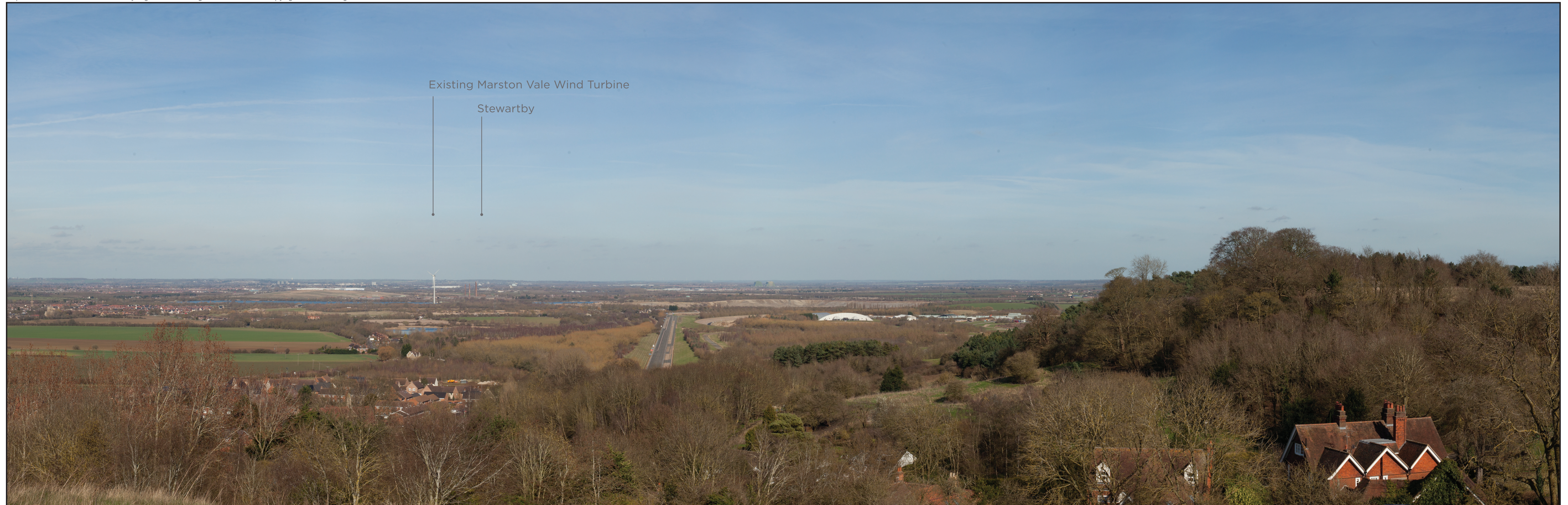
Existing baseline view from Picnic area Lidlington. (72 degrees horizontal field of view, 64cm viewing distance). View direction 49 degrees. (Cylindrical projection). Camera: Canon EOS 5D Mark II Focal Length: 50mm Camera Height: 1.5m Date: 13/03/17 Time: 14:05